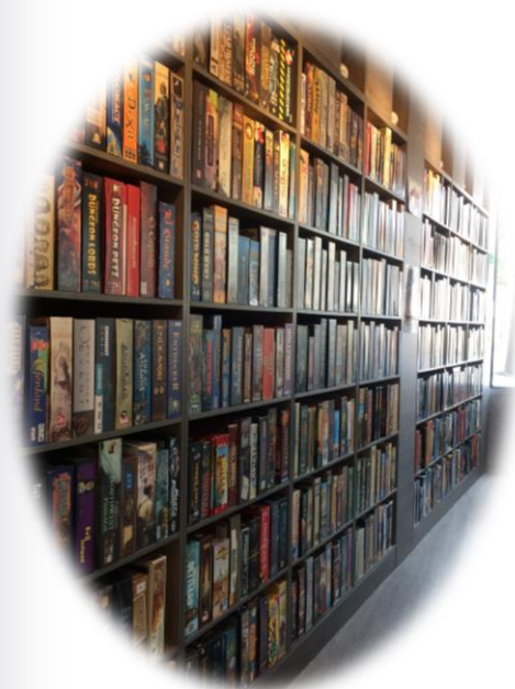
Ludentology™ is a registered trademark of Ludorati UK Ltd.